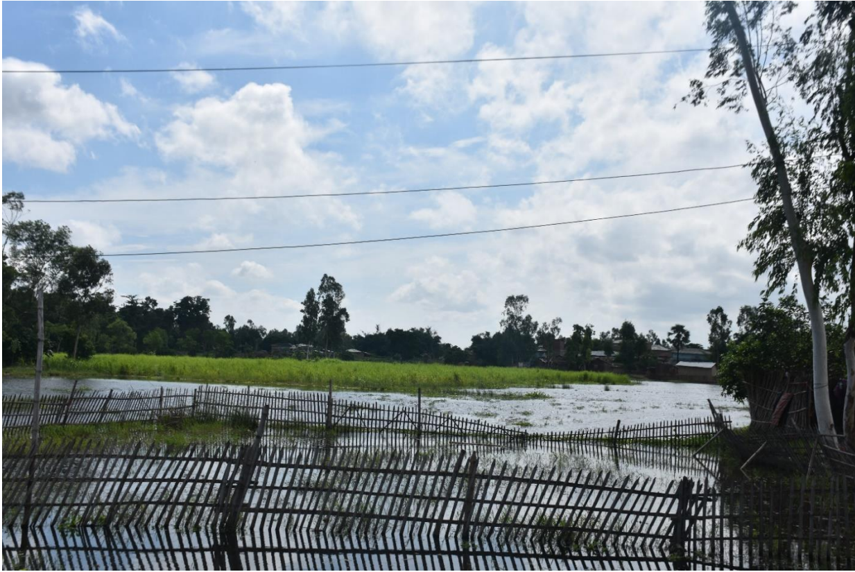
Inundation and local mitigation measures in Samsi Rural Municipality. on July 28, 2019