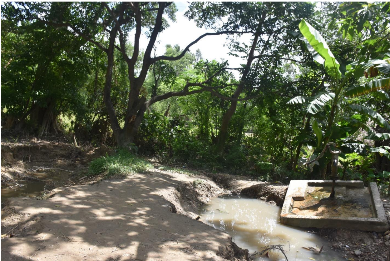
Damages on tube well in Samsi Rural Municipality. Photo by Bhesh Parajuli on July 28, 2019.