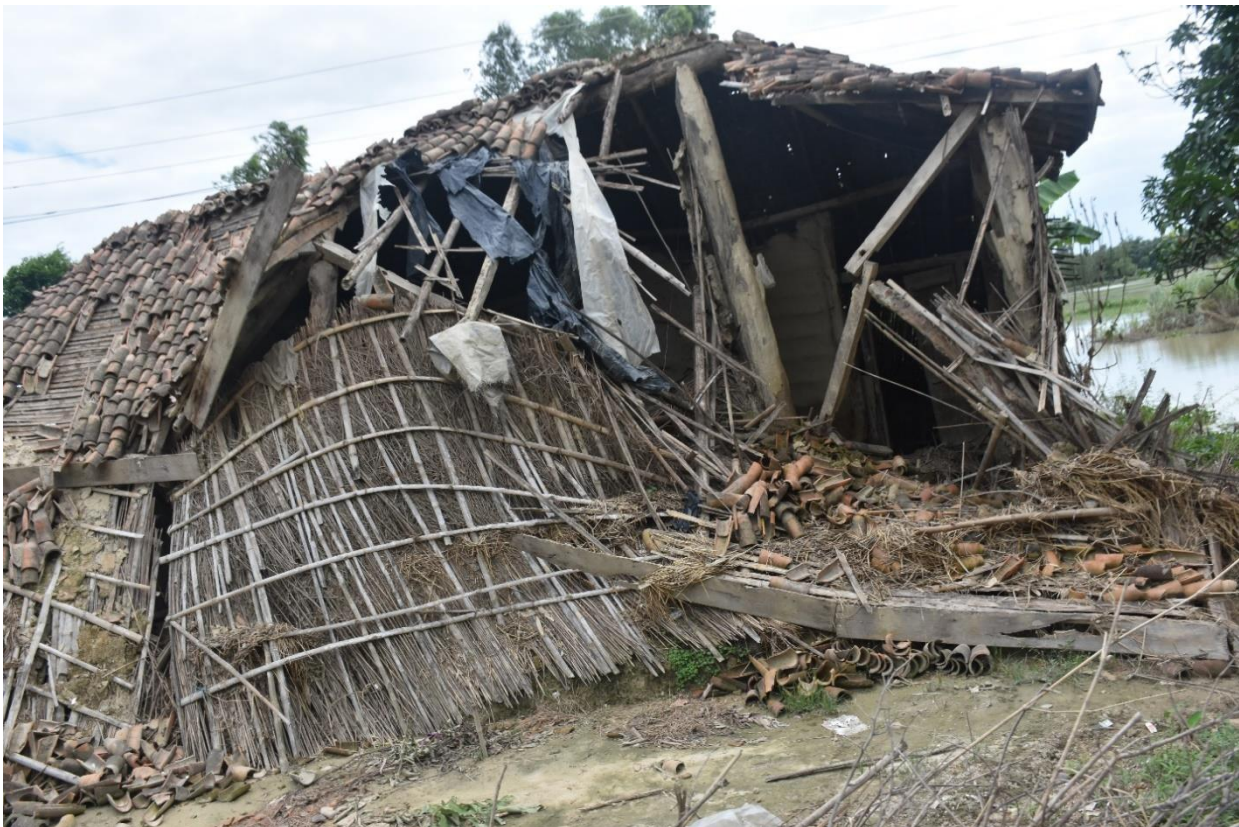
Damaged house in Samsi Rural Municipality. Photo by Bhesh Parajuli on July 28, 2019.